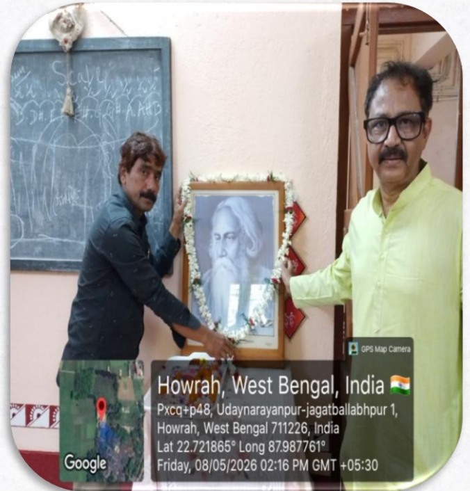
Howrah, West Bengal, India Pxcq+p48, Udaynarayanpur-jagatballabhpur 1, Howrah, West Bengal 711226, India Lat 22.721865° Long 87.987761° Friday, 08/05/2026 02:16 PM GMT +05:30