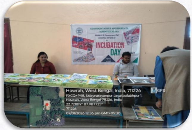
Howrah, West Bengal, India, 711226 PXCQ+P48, Udaynarayanpur-Jagatballabhpur 1, Howrah, West Bengal 711226, India 22.721819° 87.987725° 711226 07/01/2026 12:36 pm GMT+05:30