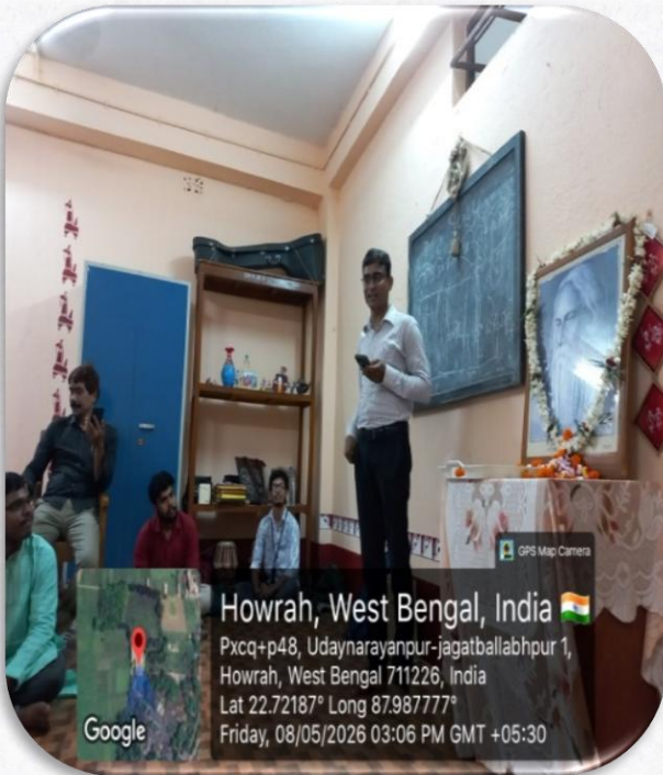
Howrah, West Bengal, India Pxcq+p48, Udaynarayanpur-jagatballabhpur 1, Howrah, West Bengal 711226, India Lat 22.72187° Long 87.987777° Friday, 08/05/2026 03:06 PM GMT +05:30