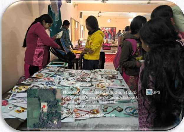
Howrah, West Bengal, India, 711226 PXCQ+P48, Udaynarayanpur-Jagatballabhpur 1, Howrah, West Bengal, 711226, India 22.721874° 87.987613° 711226 07/01/2026 12:36 pm GMT+05:30