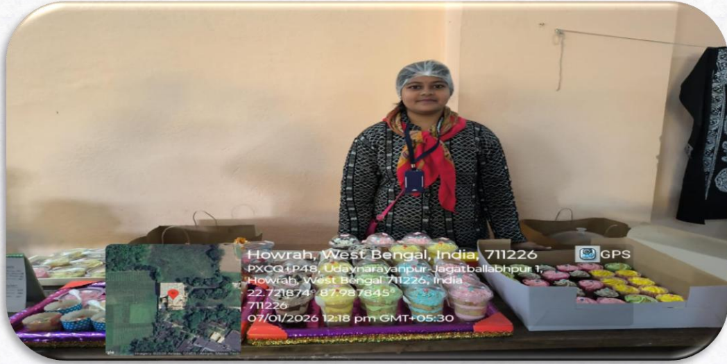
Howrah, West Bengal, India, 711226 PXCQ+P48, Udaynarayanpur-Jagatballabhpur 1, Howrah, West Bengal 711226, India 22.721874° 87.987645° 711226 07/01/2026 12:18 pm GMT+05:30